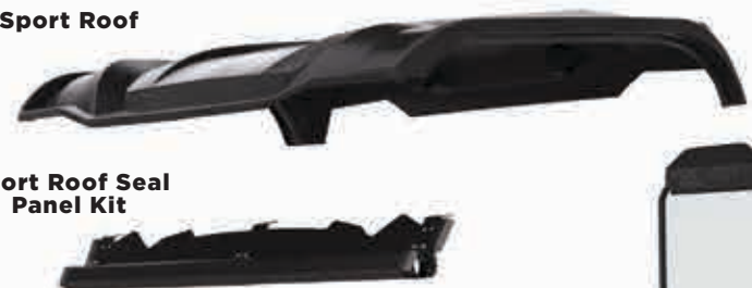
Sport Roof Seal Panel Kit