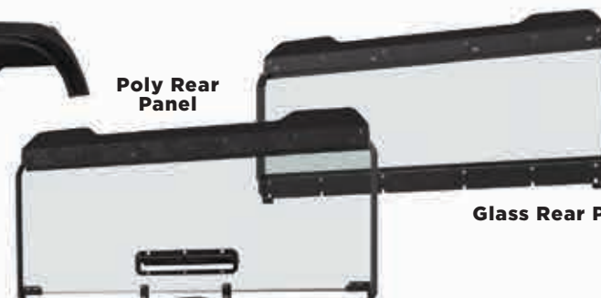
Glass Rear Panel